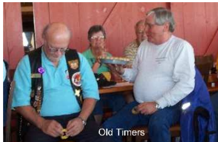
We welcomed some long time WA-L members to the September meeting that we hadn't seen in years.