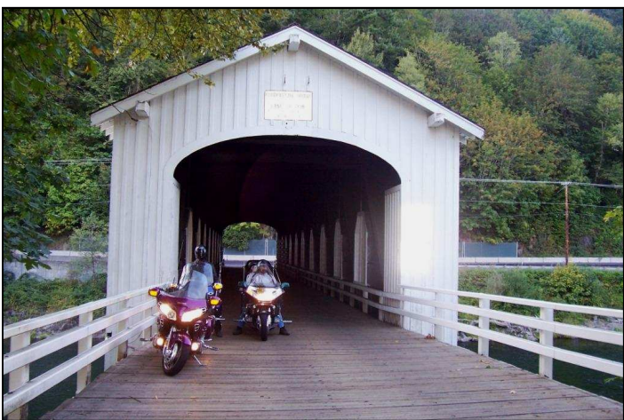
Loren, Mark, & Sherry on Goodpasture Covered Bridge

Our next bridge was the Goodpasture Bridge (1938) . Near Vida, Oregon, it is the second longest covered bridge and one of the most photographed covered bridges in the state. By now we've figured out that some of the prettiest pictures of these bridges are from the side... and that's where the water is—not the road.