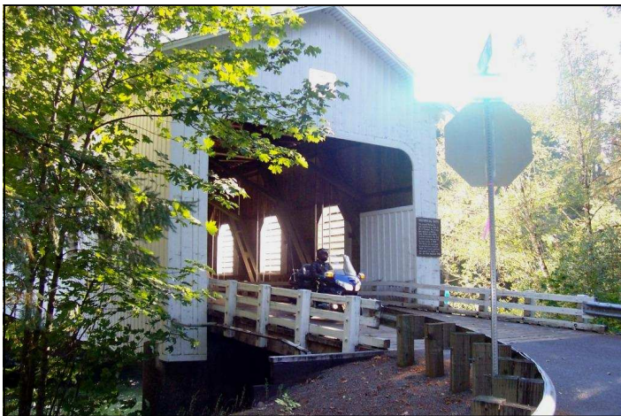
Loren riding across Belknap Covered Bridge

hard to get good pictures because of all the traffic.