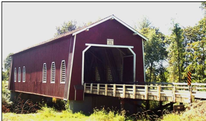
Shimanek Covered Bridge near Scio, Oregon

river below and headed out for our next photo op. After a few turnarounds and backtracking, we found our first (and only) red bridge— Shimanek Covered Bridge (1966) . It's the fifth bridge on the site since the late 1800s—having fallen victim to floods and high winds and other natural disasters over the years.