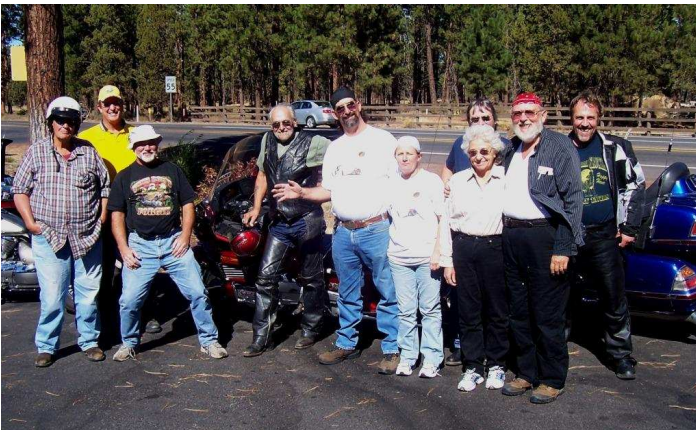
Group riders take a break near Sisters, OR