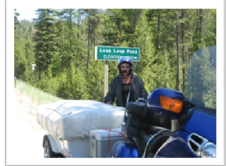
Loup Loup Pass our first pass

history of his bike and the rides he went on. We needed to get back on the road as it was approaching 11:00 am and was starting to warm up. So off across the Colville Indian Reservation, traveling was slow due to fresh chip sealing that had been done to the road. We made it to Omak around 1:00 pm, we were ready for lunch, and we needed fuel as well. We finished our road side picnic and off to the first pass over the 4000 foot mark, Loup Loup (elevation 4020) on Hwy 20. After we summated we headed down to Twisp then Winthrop. Winthrop is a quaint little town with a western