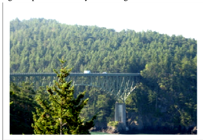
Deception Pass Bridge

We continued on to Sedro Wooley for fuel and decided to continue on to Anacortes for the night. We arrived at the camp ground in Anacortes where we set up the tent trailer. In the late 1950s Shell and Texaco built refineries on March point. Then in the late 1960s expensive housing developments were built, most notably in the Skyline area. Many retired persons were attracted to the area. Technology-based industries arrived beginning in the late 1980s. Marinas appeared where once there had been mills and canneries. Motels and other tourist-based industries grew. Morning again came early as we slowly made our way out of the nice warm sleeping bags. After getting the tent trailer packed we were ready for another exciting day of riding and sights. Only on the road for a short time on Hwy 20, we found ourselves stopping to view the majestic beauty of Deception Pass Bridge and surrounding sites. Deception Pass Bridge, connecting Whidbey Island to Fidalgo Island is a popular spot for photographers looking to capture the beauty of the Puget Sound. A Public