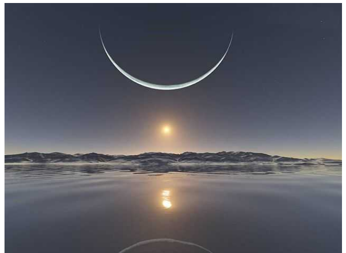
Sunset at the North Pole.